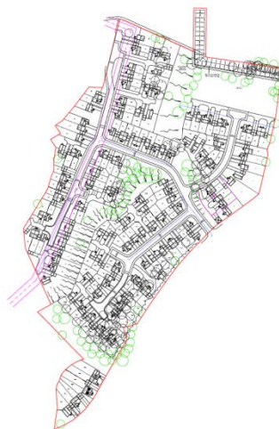
Hollins Paper Mill, DARWEN DO NOT SCALE. ALL DIMENSIONS IN METRES UNLESS OTHERWISE STATED. THIS DRAWING IS COPYRIGHT